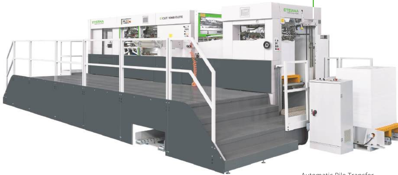
Automatic Pile Transfer System (APT) (Optional)